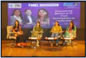
Pg: 6 ▶ PANEL DISCUSSION ON "EMPOWERING WOMEN IN IT: FROM PARTICIPATION TO LEADERSHIP"