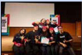
Pg: 17 ▶ BEYOND CLASSROOMS: FOBA STUDENTS EXCEL ACROSS DIVERSE NATIONAL PLATFORMS