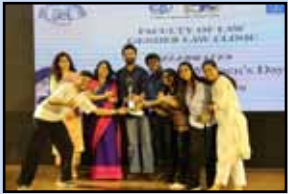
Pg: 8 ▶ CELEBRATION OF INTERNATIONAL WOMEN'S DAY