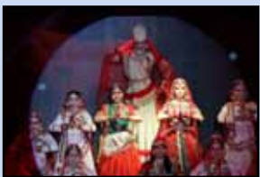
Pg: 12 ▶ CELEBRATING ART, CULTURE, AND CREATIVITY AT KALA MANCH - 3RD EDITION