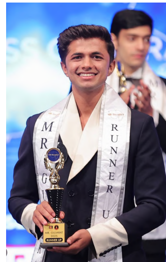
The Faculty of Performing Arts congratulates all the

winners for their exceptional achievements and for representing GLS University with talent, grace, and passion. Their success is a reflection of the university's commitment to nurturing confidence, creativity, and performance excellence.